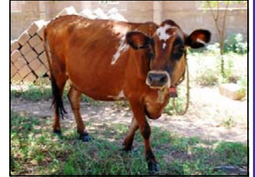
"Barbara", Nghonghonha's 'Holy Cow'