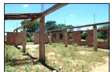
The old parish church & the progress of the construction.