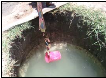
One of the water sources in Itiso parish.

Not having access to fresh, clean water is a problem that many parishes in the Diocese of Central Tanganyika deal with on a daily basis. Many parishes have wells that do not work, forcing them to use contaminated water or travel miles to neighboring villages for access to clean water. The Church of the Holy Communion in Mahopac, New York is currently assessing the water situation in their link parish of Itiso in hopes of improving their water issues.