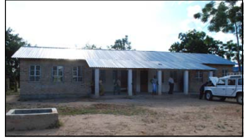
Hombolo Makulu's brand new kindergarten building funded by St. Thomas' Church.