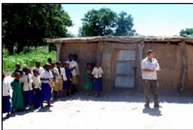
Checking out the parish church with school children at Nhinhi.