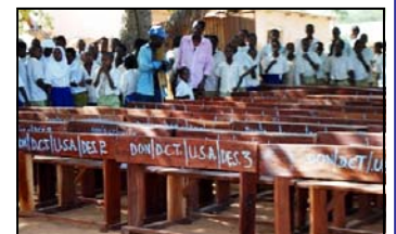
Brand new desks at the dedication in February.

In addition to funding the church construction, St. Paul's has also been helping to support several schools in Mwitikira. On February 27, a dedication took place in which the primary school was presented with brand new desks and several boxes of new books for each grade. The dedication was attended by hundreds of students, parents, guardians, teachers, and village members, and it was quite the celebration! Several Carpenter's Kids staff members were present at the dedication to present the new supplies on behalf of St. Paul's, and the parish was thrilled to hear that visitors from Virginia would return to Mwitikira in a very short time. It is wonderful to witness the exchange of love and support between link parishes in The Carpenter's Kids program, and the relationship between St. Paul's and Mwitikira is a perfect example of what this friendship can achieve.