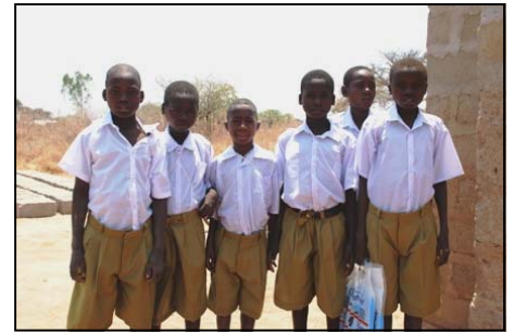
Carpenter's Kids at Chifutuka parish in September.