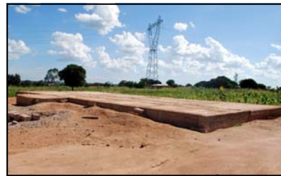
The foundation of the Nala library.