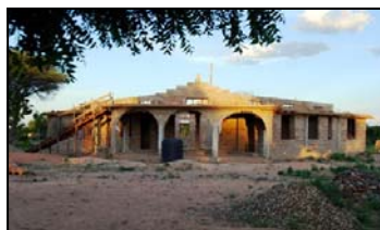
The progress of the Mwitikira church construction.